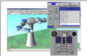
MOTOSIM EG-VRC (OPTION)