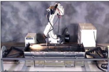
LARGE PART PROCESSING