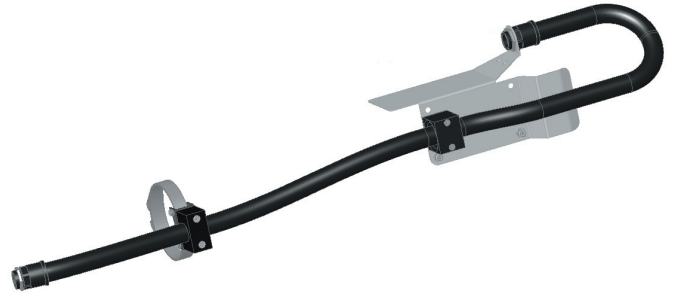
Upper arm IRB 1400, 2400/L5 P0031, P0032: