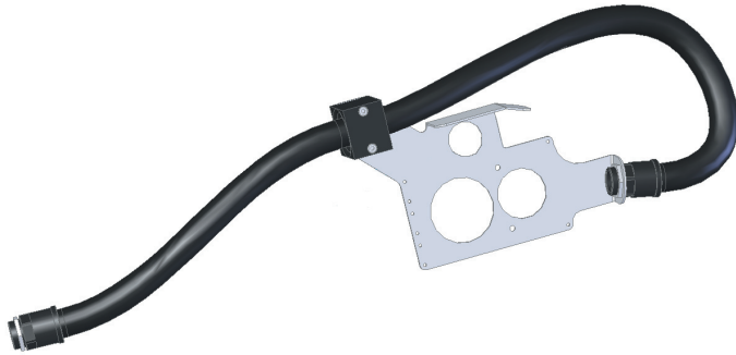
Upper arm IRB 140 P0030: