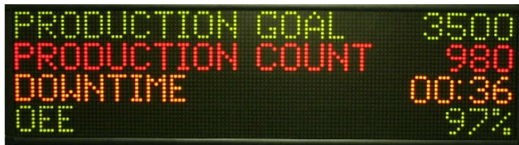
Production Marquee (Part # PM-0420-T)

DataVisor Marquees has built the Production Marquee Series that combines a visual display with ethernet communications, digital I/O, and web server technology integrated into one self contained package. With no software to install and the data source formulas programmed into the marquee, all you have to do is select the functionality of the application from drop down menus. Setup and monitoring of this real time production data is as simple as opening a web browser and entering the IP address of the marquee display. Imagine real time plant floor production data monitored and collected anywhere within your facility. Just supply two inputs, enter your target counter value and cycle time and the Simple OEE calculation is displayed, monitored, and collected by simply choosing OEE as the data source. Additionally, you can select your Goal, Break Schedule, and other Production Data Sources that are important to view and monitor from your production process.