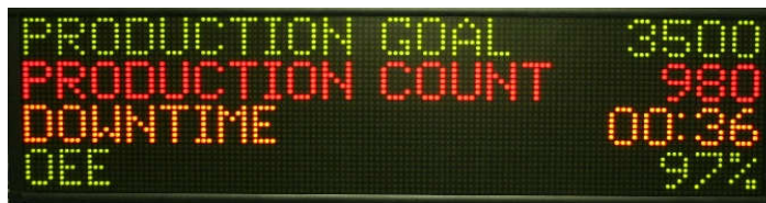
Production Marquee (Part # PM-0420-T)

DataVisor Marquees invites you to take the time to read this guide to understand Simple OEE and how to implement this tool in your facility. After reading our "Complete Guide to Simple OEE" you will have a better understanding of Simple OEE and how we can help you visualize, monitor, and collect OEE data in your plant with the Production Marquee.